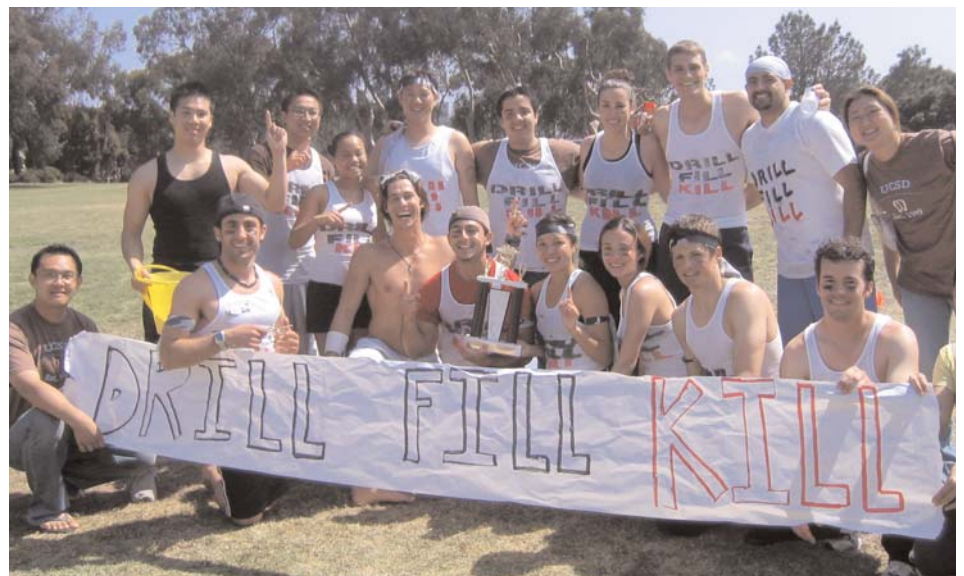
Pre-Dental Society competitors and fans after winning the trophy