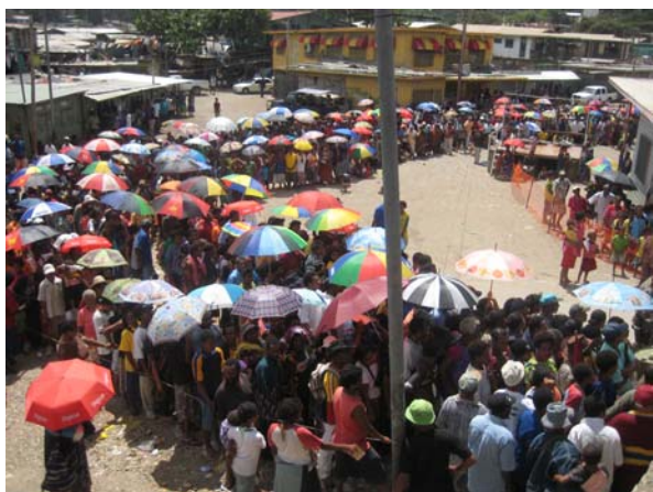
Patients line up in Papua New Guinea.