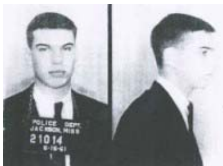
Congressman Bob Filner's mug shot during the civil rights movement.

Education, the importance of access to medical care, and special attention to